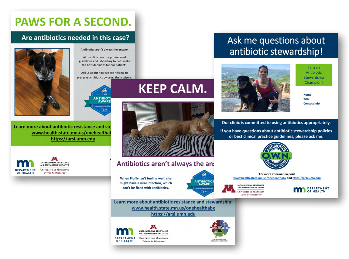
Figure 2: Sample AS commitment posters

https://www.avma.org/PracticeManagement/ClientMaterials/Pages/clinic-posters-be-careful-antibiotics.aspx